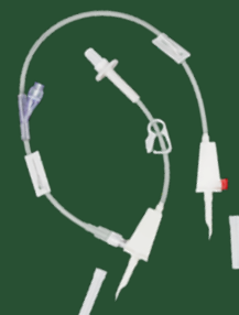
CODAN Mix-Ad Inline/1