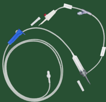
CODAN Guard® Mix-Ad Set/1 (1 Spike)