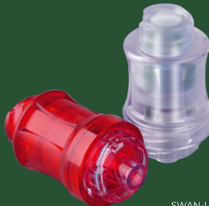
SWAN-LOCK® / SWAN-LOCK® RED

SWAN-LOCK® RED in transparent red housing colour coding, for e.g. arterial access identification.